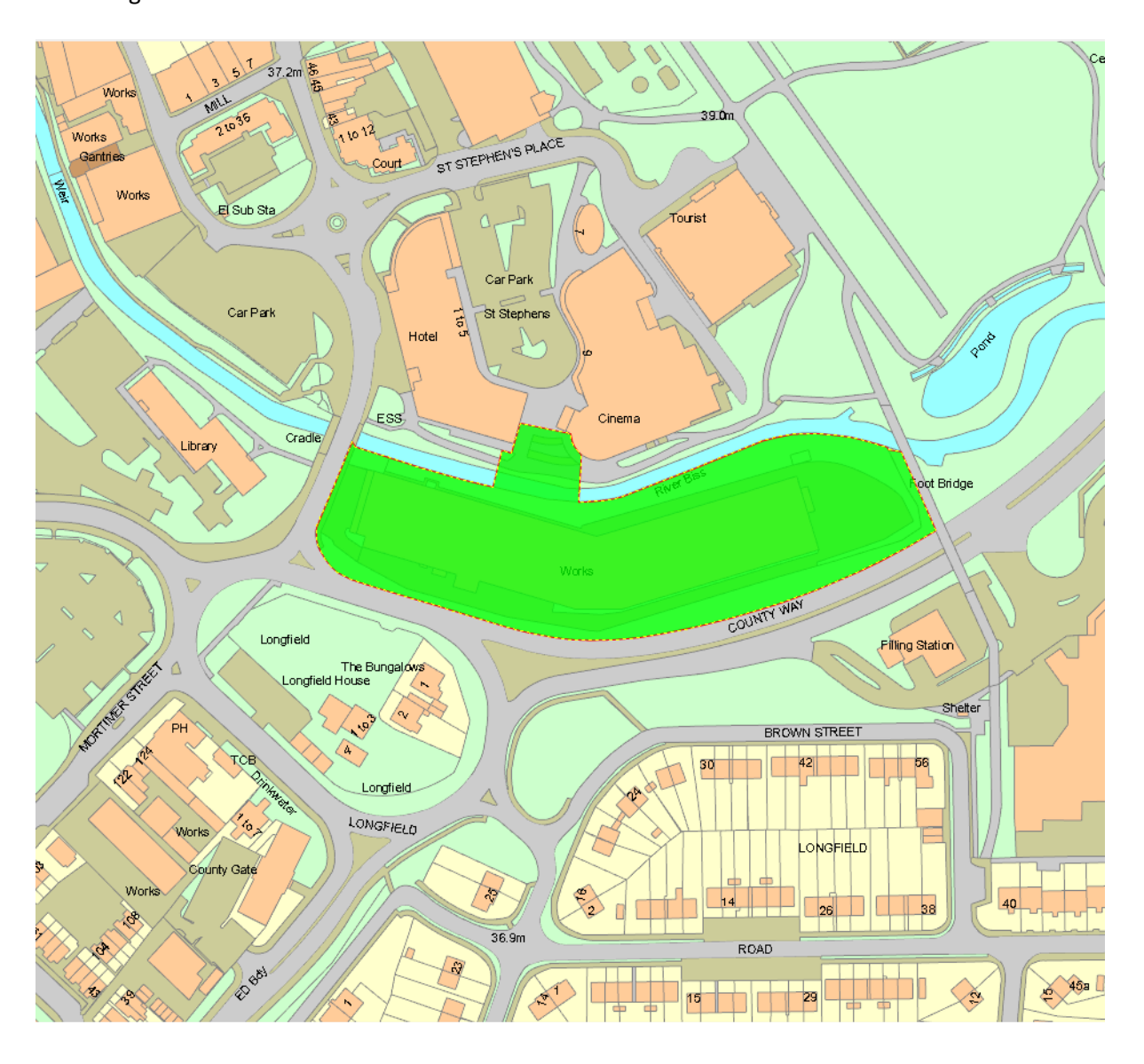
{\it Item 1-15/00636/FUL-Former\ Peter\ Black\ Toiletries\ Factory\ \ Cradle\ Bridge\ \ Castle\ Street\ Trowbridge}